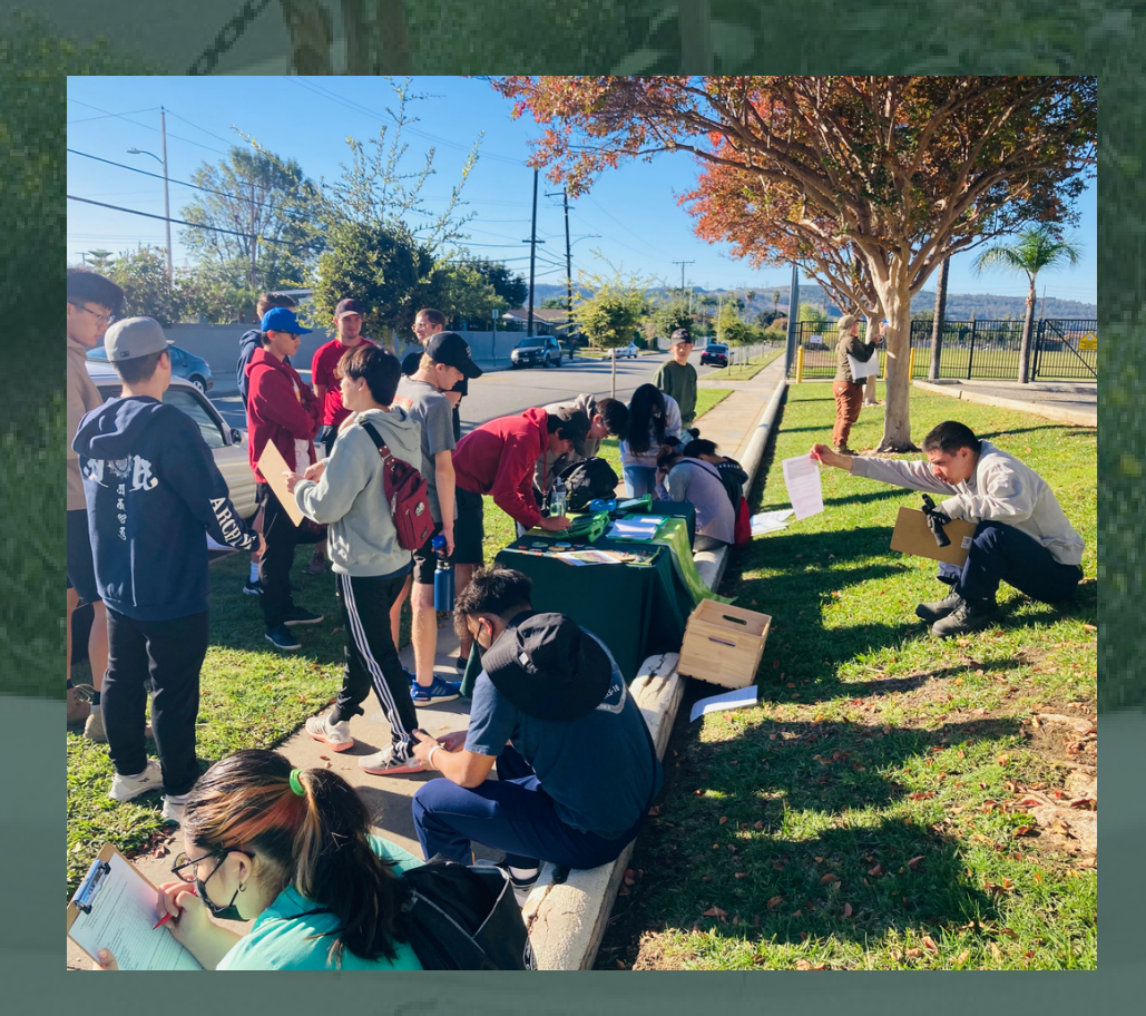
Greening Event-Bassett HS