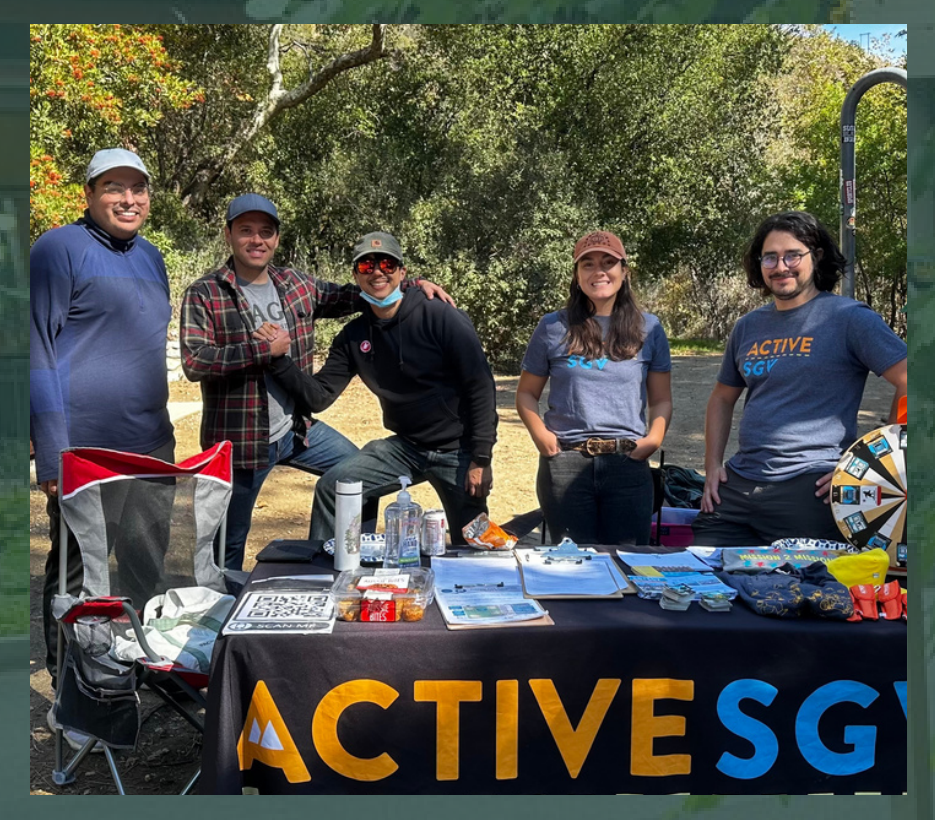
Glendora Trails Day