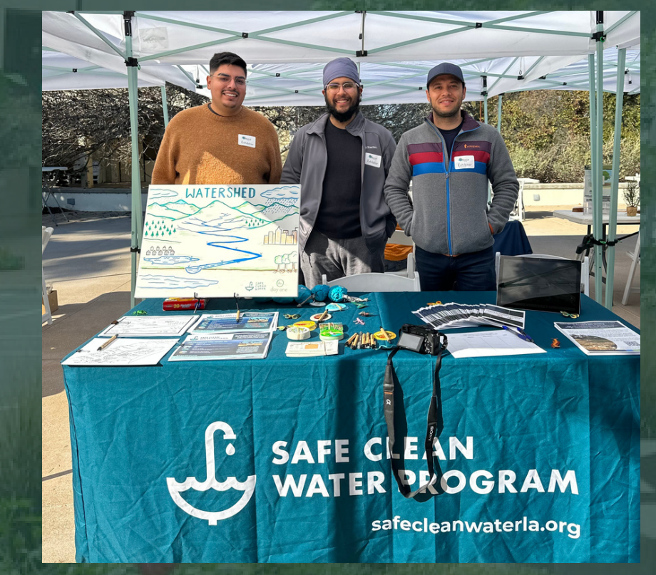
California Botanic Gardens Waterwise Festival