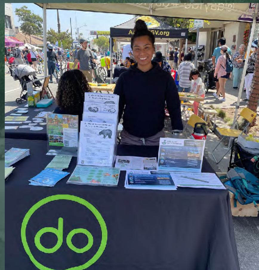
May- 626 Golden Streets