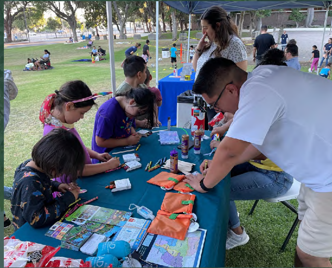
July - Movies in the Park