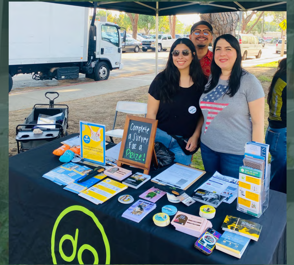
August - National Night Out