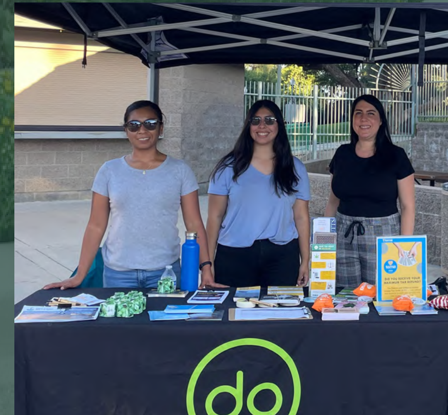
August- Movies in the Park