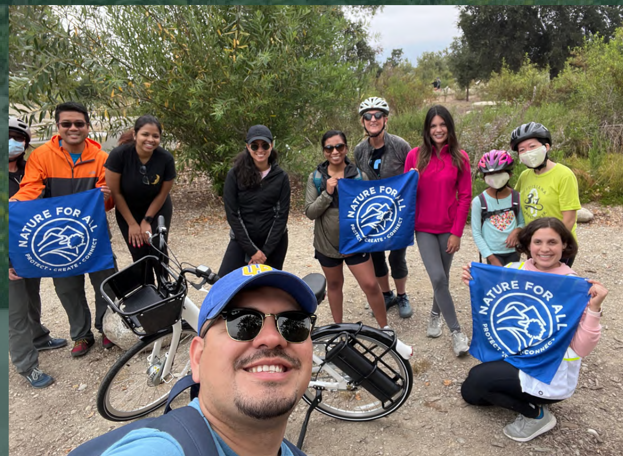
June- Watershed Bike Ride