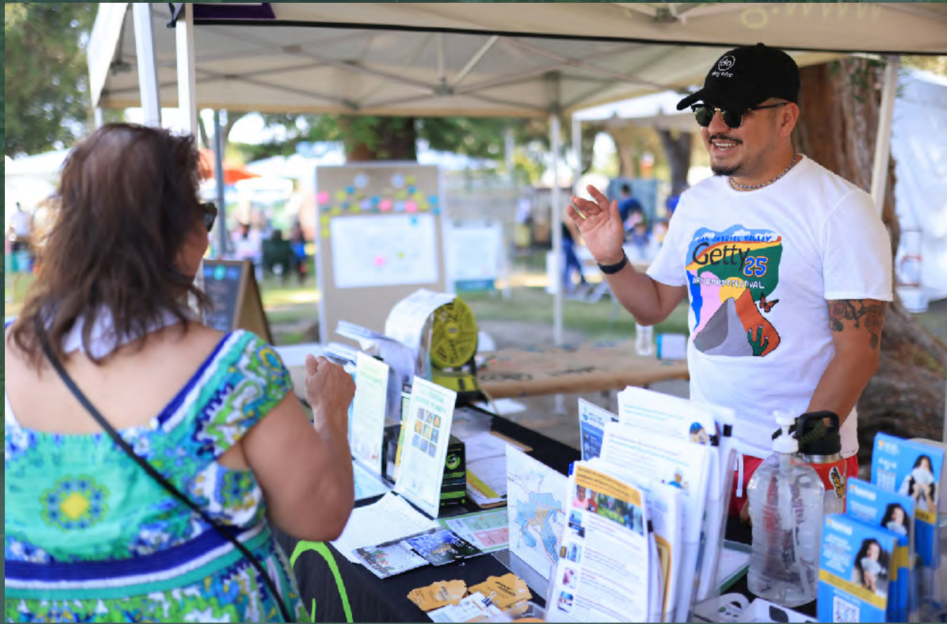
July SGV Getty Festival