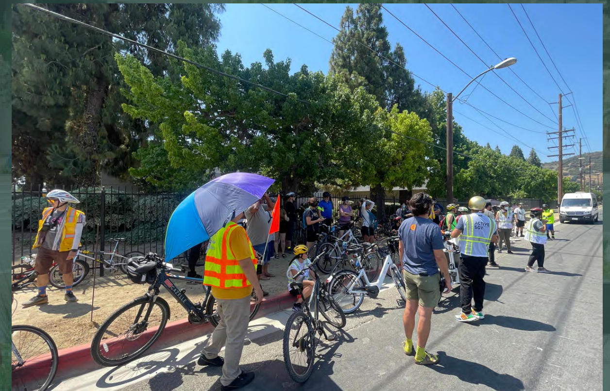
June- Toxic Tour Bike Ride