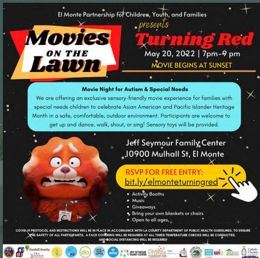
May- Turning Red Movie Night