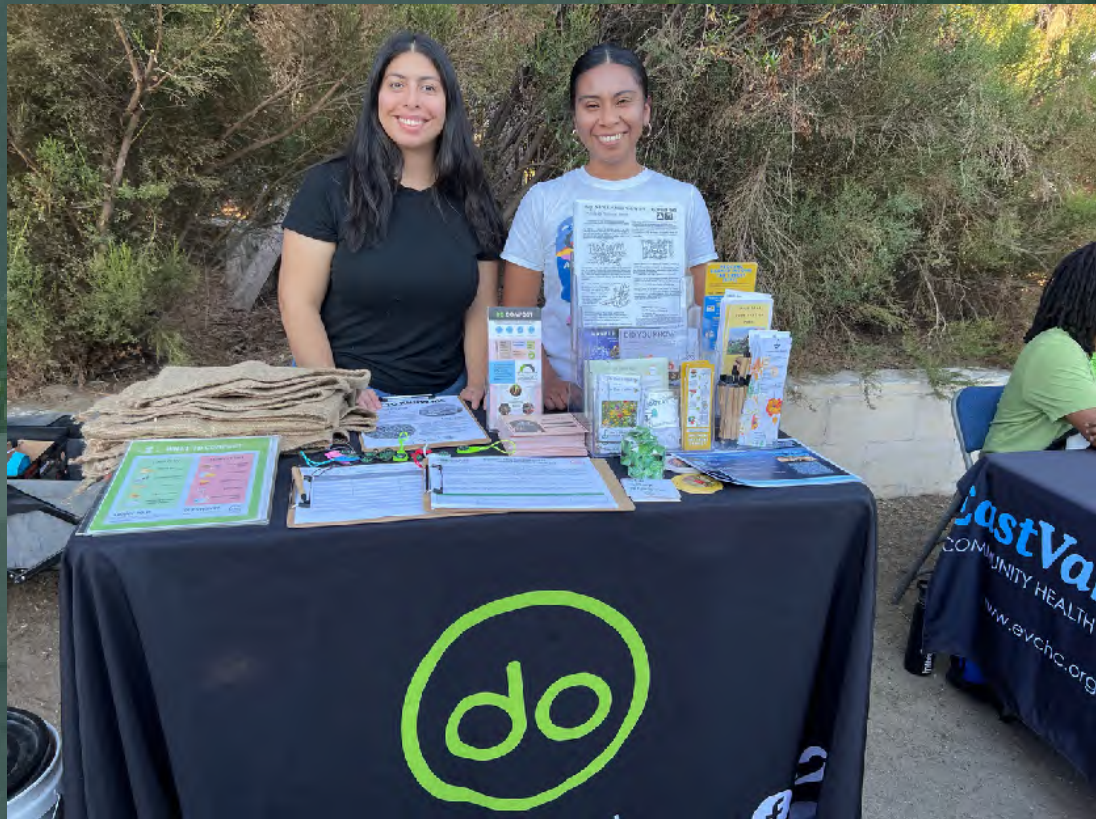
August - Lopez Family Farm