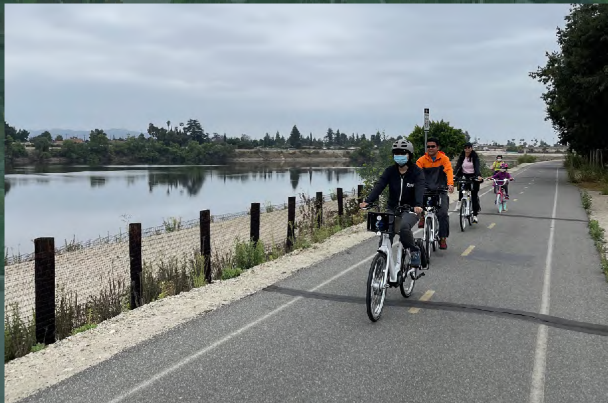
June- Watershed Bike Ride