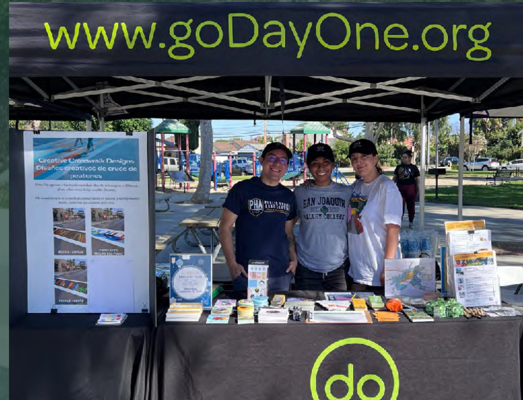
August- El Monte Back to School