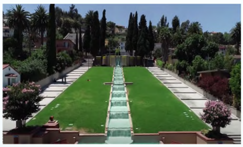
Cascade Park, Courtesy of City of Monterey Park.