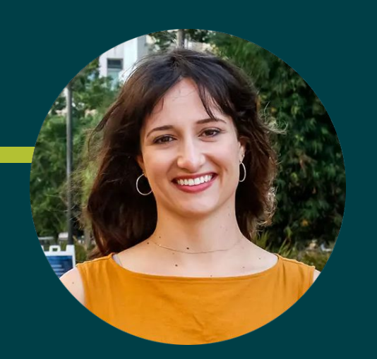
WATERSHED COORDINATOR PUBLIC HEALTH/RESEARCH